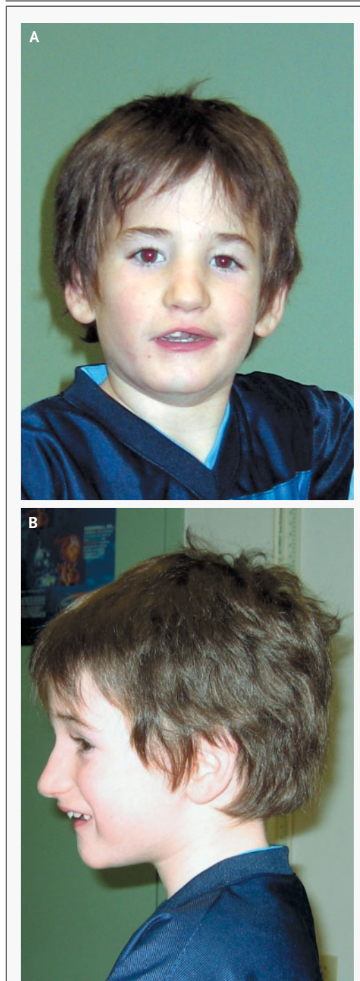
Figure 1. Photographs of Patient 1 at the Age of Eight Years.

The proband (Patient 1) was born after a full-term pregnancy complicated by maternal Crohn's disease and poor weight gain. (Patient 1's mother died when he was four years three months old.) His birth weight was 2520 g (below the 5th percentile), his length was 44.5 cm (below the 5th percentile), and his head circumference was 33 cm (at the 10th percentile). He initially required gavage feeding and was evaluated for failure to thrive and hypotonia at 13 months. According to a parental report, he sat at one year and walked at two years. He was evaluated by a speech pathologist and given diagnoses of moderate-to-severe language delay at the age of two years and severe delay in receptive and expressive language at the age of three years two months. When he was four years two months of age, attention deficit–hyperactivity disorder (ADHD), an overall developmental delay, an unspecified sleep disorder, and a severe delay in speech and language and in fine motor skills were diagnosed. Results of be-